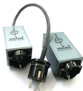
Available with or without cable at the same price

For example, the use with powered subwoofers was not recommended because of a poor price/performance ratio, while now the MiniBlack is naturally suited for this application.